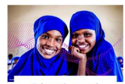
Education and research