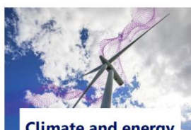
Climate and energy