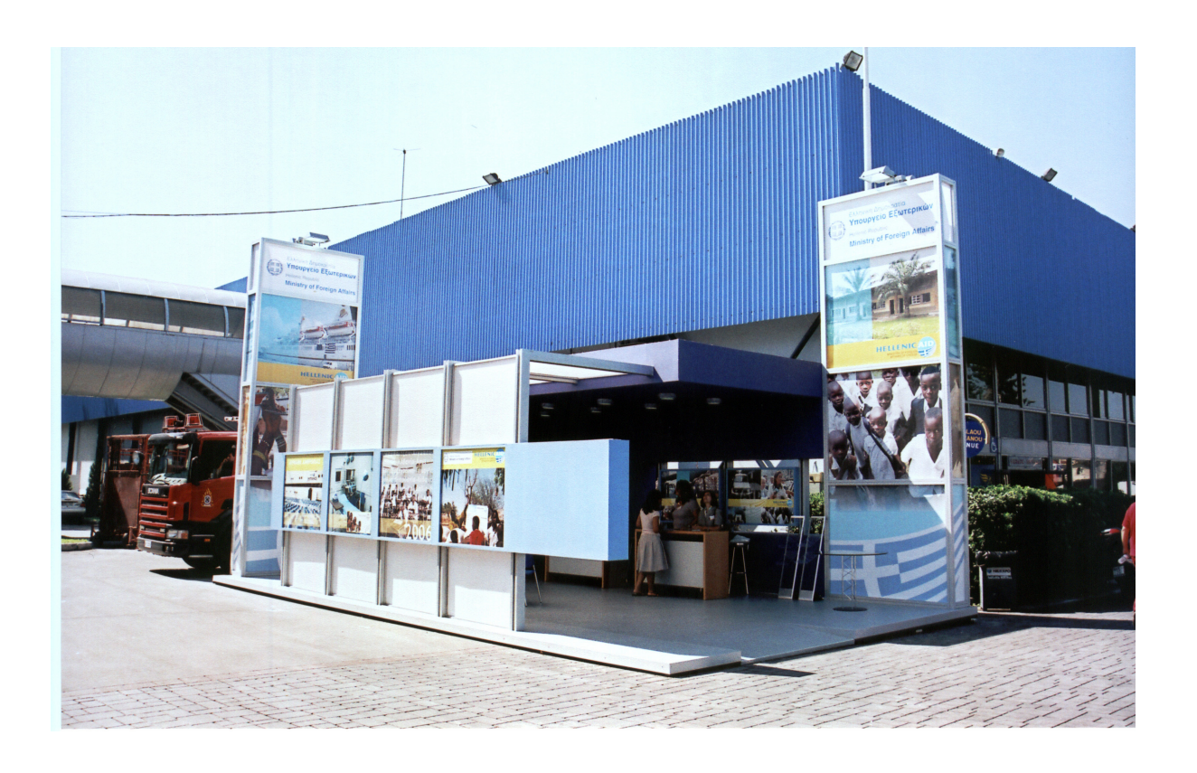
HELLENIC AID special exhibition stand at the Thessaloniki International Fair.