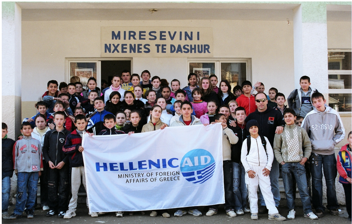
Training on Prevention, Protection, Confronting Emergency Situations & Administering Crises. Financing: HELLENIC AID Implementation: Hellenic Rescue Team ALBANIA