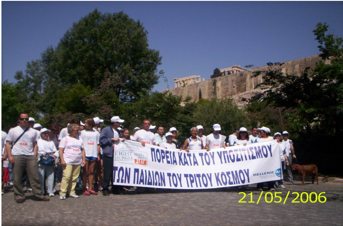
Participation at the “Fight Hunger-Walk the World” activity that was organised by the World Food Program (WFP) of the U.N and took place on May 21 st 2006 in Athens and in other cities around the world.