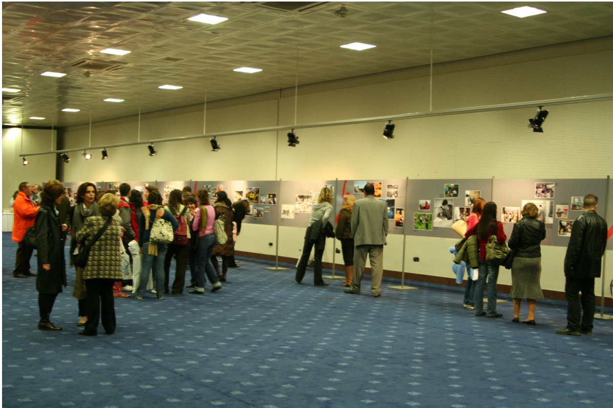
Co-financing of a photo exhibition “click on volunteerism” that was organised by “Ergo Politon” on December 5 th 2006, World Day devoted to Volunteerism, at the “Syntagma” metro station.