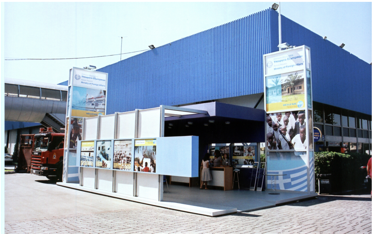
HELLENIC AID special exhibition stand at the Thessaloniki International Fair.