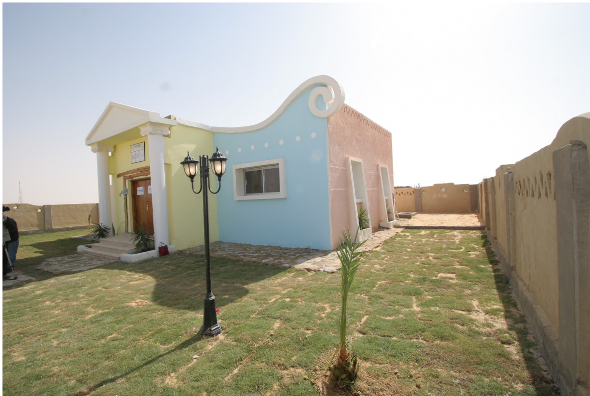
Construction of a Pre-Nursery School in the Farafra Oasis region for assistance provision to working mothers. Financing: HELLENIC AID Implementation: NGO "Humanitarian and Euro-cultural Development and Co-operation - H.E.D.A GREECE" E G Y P T