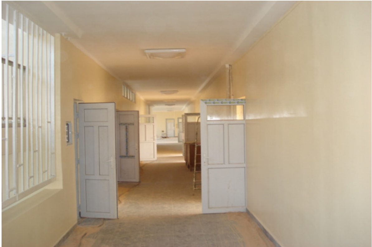
Restoration of School complex SAKOV No. 132 in Erevan (Phase B). Financing: HELLENIC AID Implementation: NGO "Developmental Co-operation and Solidarity (DCS)" A R M E N I A