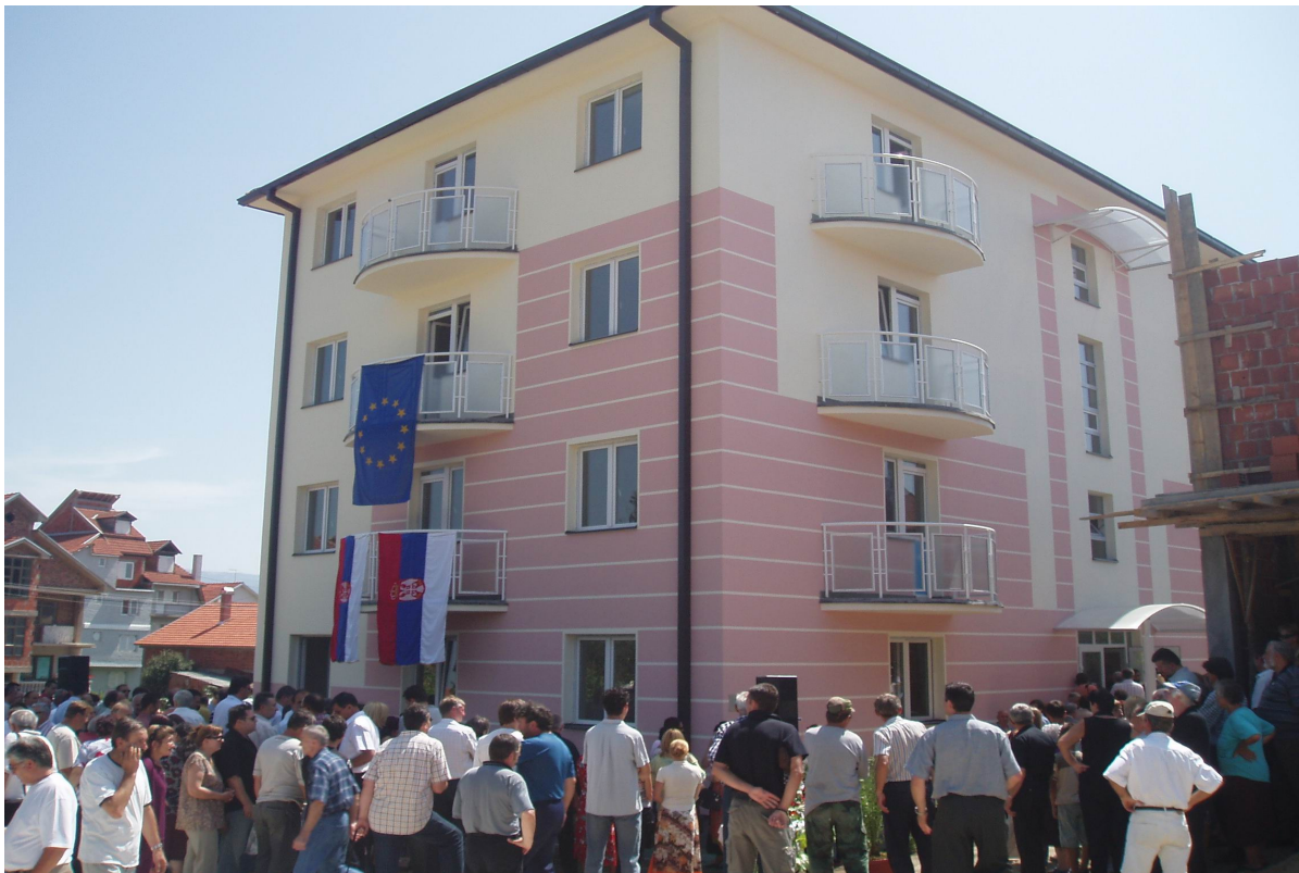
Improving living standards in Kosovo. Financing: HELLENIC AID Implementation: NGO "European Perspective" S E R B I A