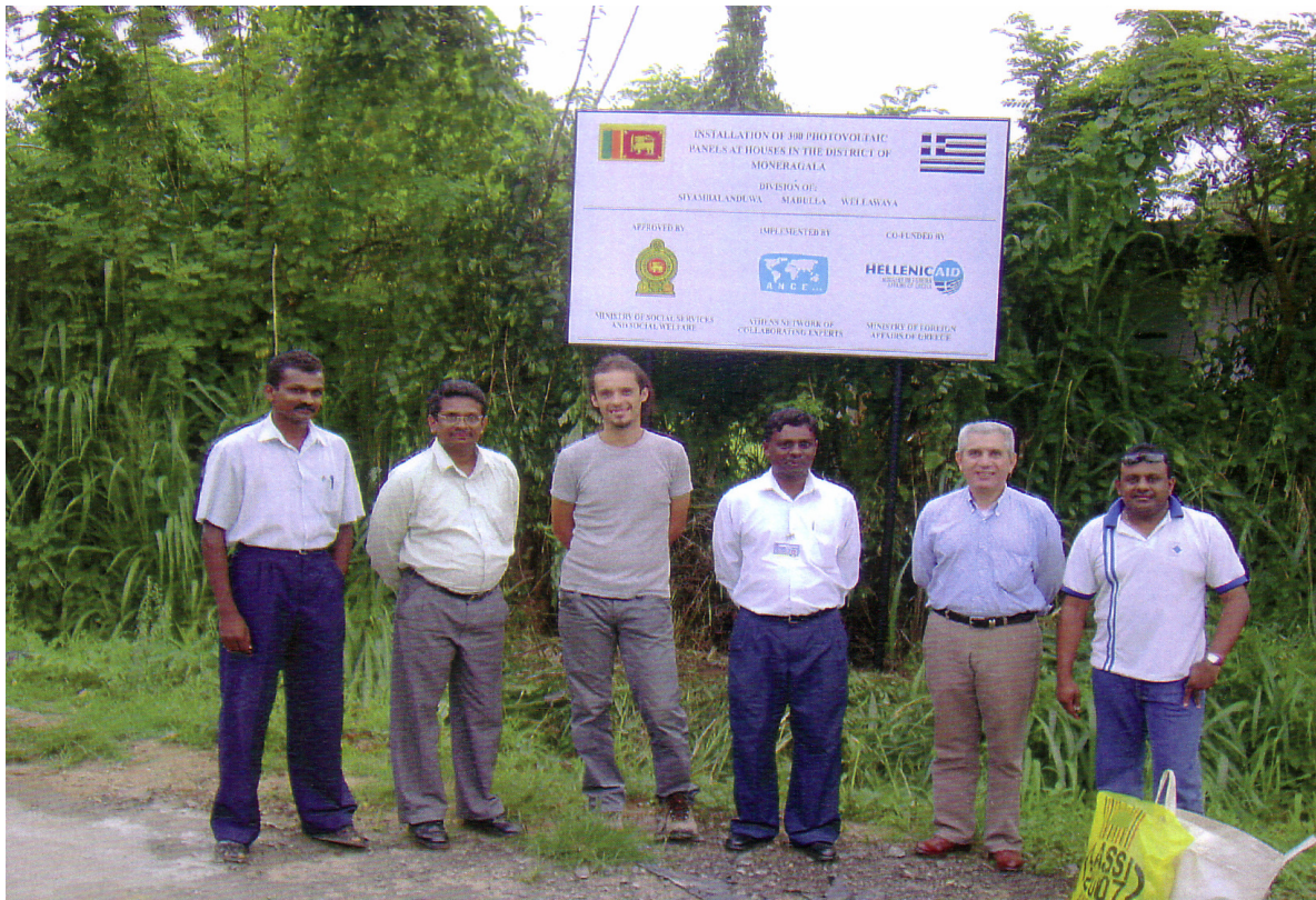
Sri Lanka reconstruction program. Installment of photovoltaic systems to 300 homes of pupils at the Monaragala region. Financing: HELLENIC AID Implementation: NGO "ANCE" S R I L A N K A