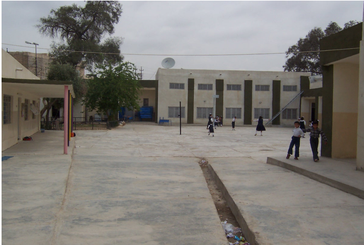
Rehabilitation of Primary & Secondary Schools. Financing: HELLENIC AID Implementation: NGO "European Perspective" I R A Q