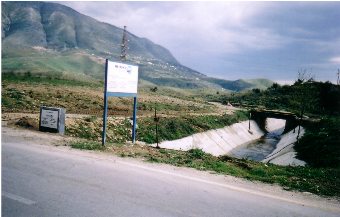
Partial rehabilitation of the irrigation canal “Thomas Filipeos” extending to 34 km and crossing four provinces of South Albania (Messopotamos, Divri, Alikos & Levadia). Financing: HELLENIC AID Implementation: NGO “Humanitarian and Development Co-operation” ALBANIA