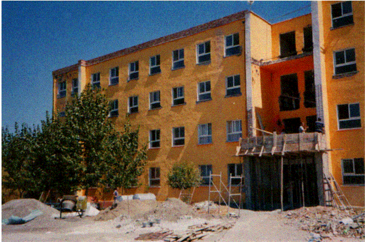
Restoration of "16 SHATORY" School building in Shijak. Financing: HELLENIC AID Implementation: NGO "Developmental C-operation and Solidarity (DCS)" ALBANIA