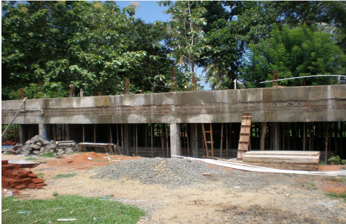
Sri Lanka reconstruction program. Extention of School buildings at the Galle region. Financing: HELLENIC AID Implementation: NGO "Doctors of the World – Greece (MDM – Greece)" S R I L A N K A