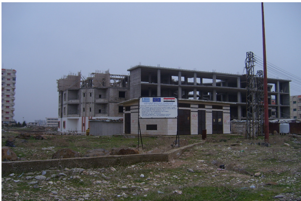
Construction of a 700m2 Medical Center at the town of Homs. Financing: HELLENIC AID Implementation: NGO "Developmental Co-operation and Solidarity (DCS)" S Y R I A