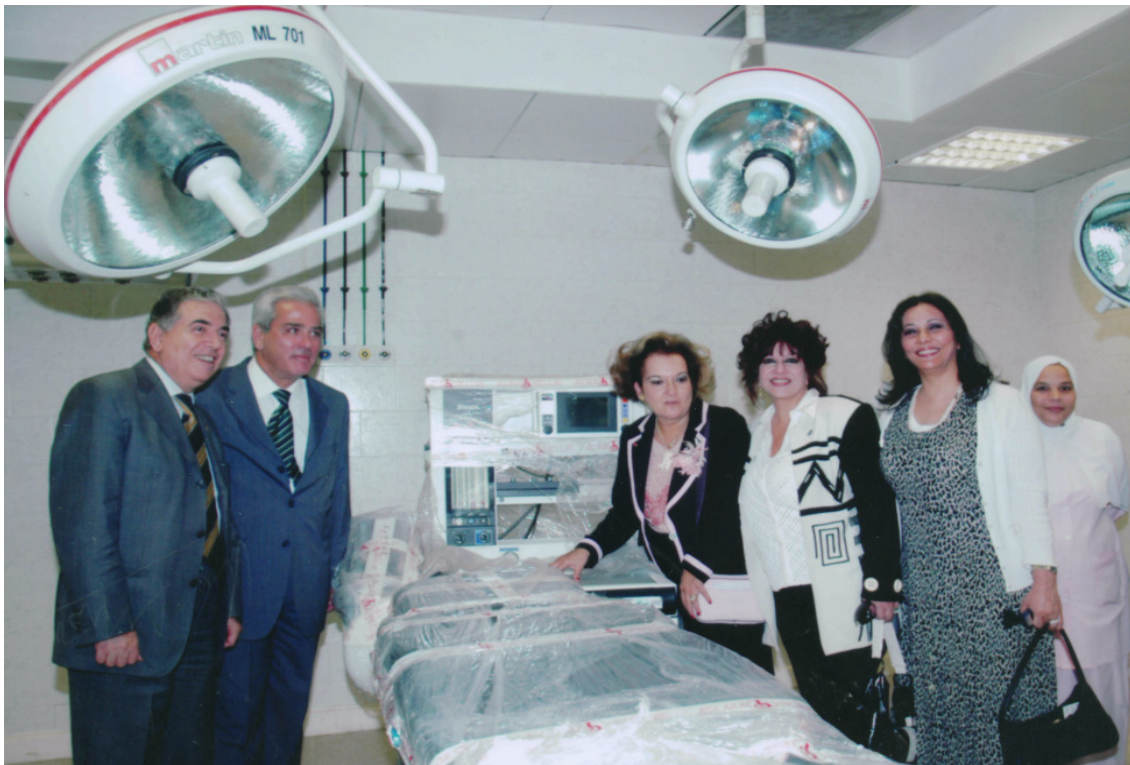
Equipping of a Medical Center at the town of Beni Suef. Financing: HELLENIC AID Implementation: NGO "Hellenic Action in Africa" E G Y P T