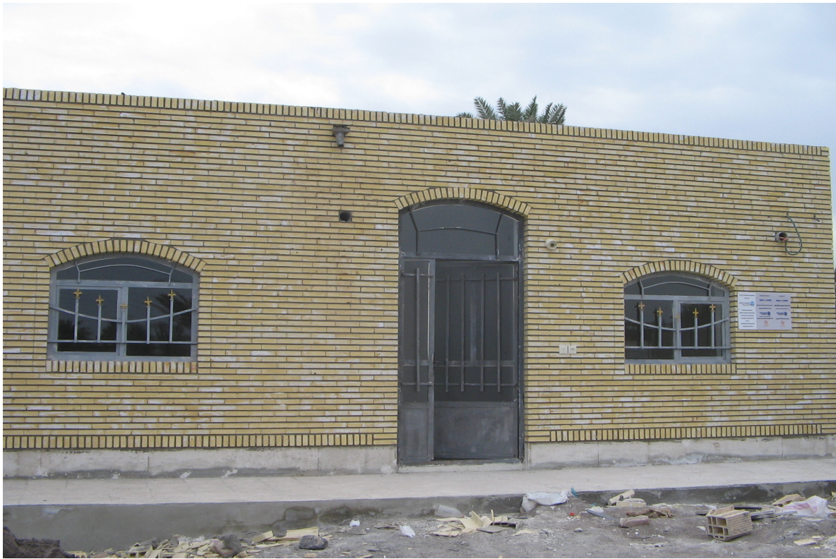
Reconstruction of houses for 22 families (aprox. 110 persons) that were destroyed by the 2003 earthquake at the town of Bam. Financing: HELLENIC AID Implementation: NGO "European Perspective" I R A N