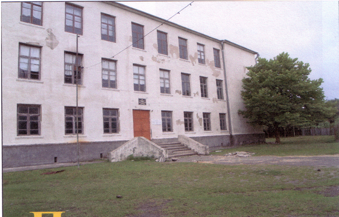
Structural restoration of Schools & Boarding Schools in Western Georgia & T'bilisi region. Restoration of the facade, side walls & replacement of windows & internal doors of the 11 th School of Poti. Financing: HELLENIC AID Implementation: NGO "International Orthodox Christian Charities - IOCC" G E O R G I A